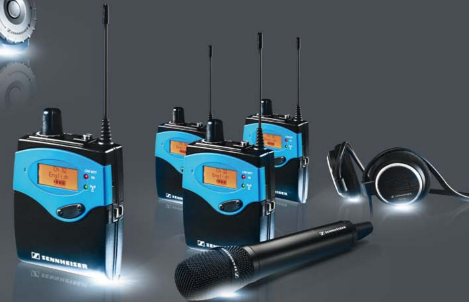
tourguide EK 1039