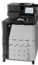
HP Color LaserJet Enterprise flow M880z Multifunction Printer

This top-of-the-line enterprise MFP helps streamline workflows and accelerate document tasks—with advanced finishing options and file sharing. Give users simple, direct access to this MFP through mobile printing and touch-to-print capabilities. 6