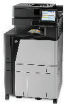
HP Color LaserJet Enterprise flow M880z+ NFC/Wireless Direct MFP Printer